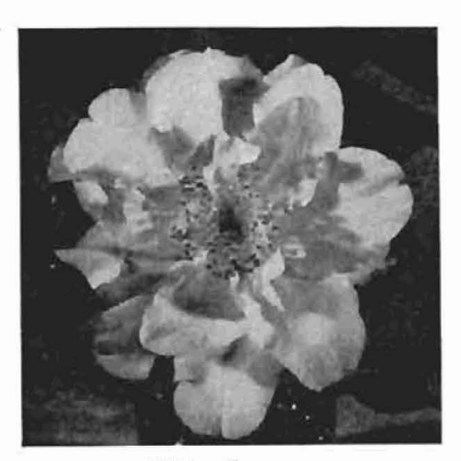
White Empress

In this area we grow more Camellia than any other section of the United States. We propagate 90% of them by cutting. This work is mostly done in greenhouses in August and September. Some varieties, however, do not thrive well by their own roots, so we graft such varieties on strong growing C. japonica or C. sasanqua root. We formerly grew