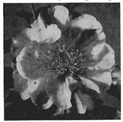
Mrs. Eddinger

spots that it is hard to believe that they would grow. Around some of the old homes that have been converted into apartment houses no one seems to take care of the plants planted around them and in the summer very rarely get watered, but they still persist in growing and blooming.