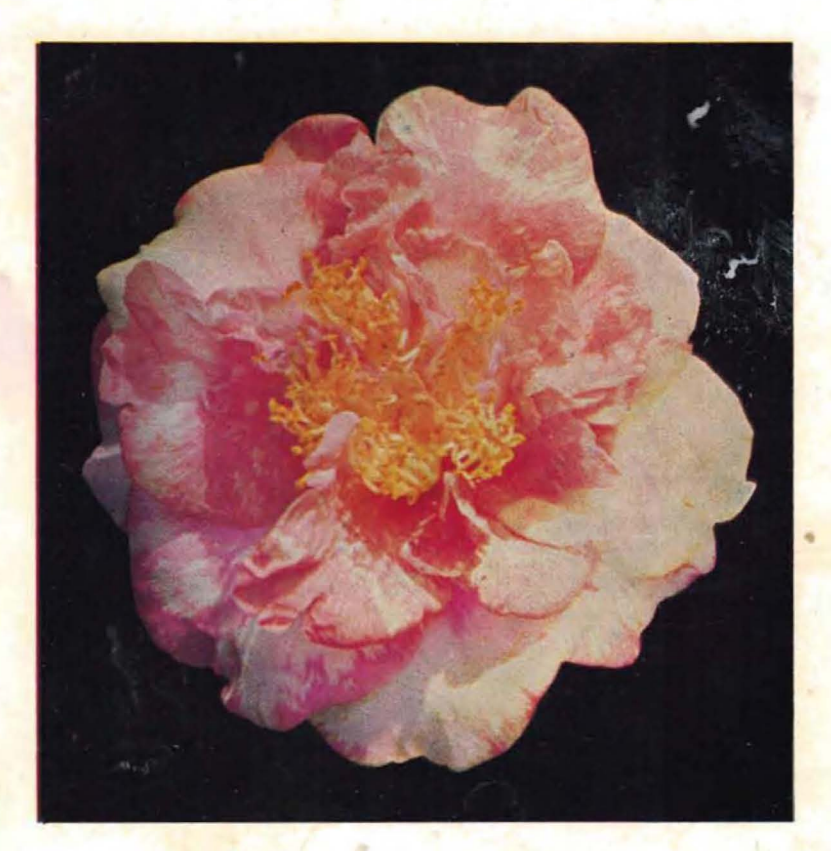
CAMELLIA JAPONICA RUTH ROYER